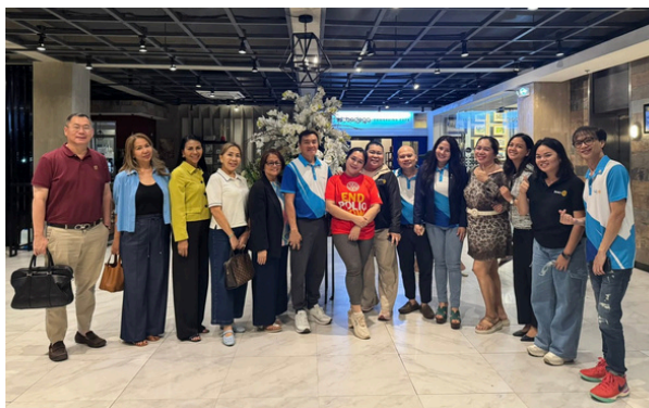
August 15, 2025 Regular Meeting Big Hotel