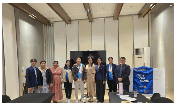
August 29, 2025 Regular Meeting Grand Residences Clubhouse